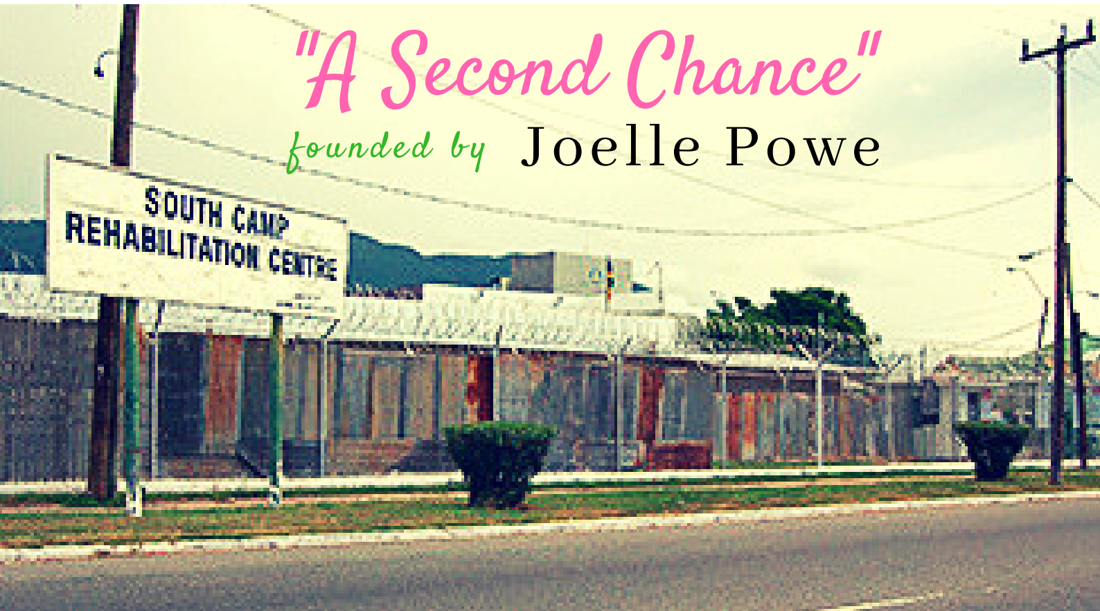
South Camp Juvenile Remand and Correctional Center Kingston, Jamaica